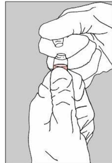
Press back to break at the cut under the red dot.